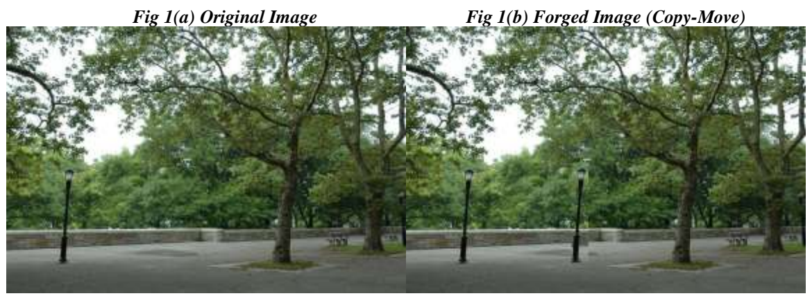
Fig 1(a) on the left side having only one street lamp but in Fig 1(b) on the right side having two street lamps, that is created by using Copy-Move Forgery technique.

The advent in digital world is changing our way in which we store and manipulate the data. Digital images are fastest means of information transfer because of their ease of acquisition and storage. These images can be used as evidence like the images that are shown in TV news can be accepted as evidence for the truthfulness of that news. Though this technology has many advantages, it can also be used for hiding facts and evidences. Today, digital images are manipulated in such a way that it is not possible to detect forgery with naked eyes. The act of illegal manipulating or reproducing document, signature, images or banknotes is called Forgery. Forgery is the process of creating fake images. Forgery is easily possible with the software's like Adobe Photoshop, GIMP, and Corel Paint shop. Some forgers performs the forgery for malicious purpose like to hide important features of an image or to convey some wrong information by changing the content. In this case, integrity and authenticity of image is lost.